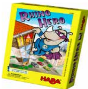
Rhino Hero game