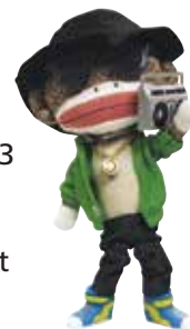
Planet Sock Monkey- Monk