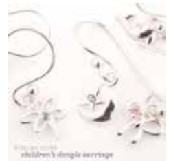
Children's Dangle Earrings