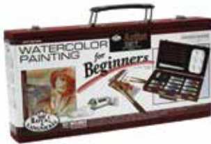
Watercolor for Beginners