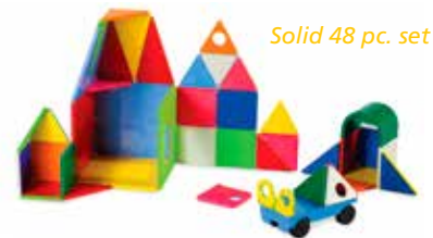
Solid 48 pc. set