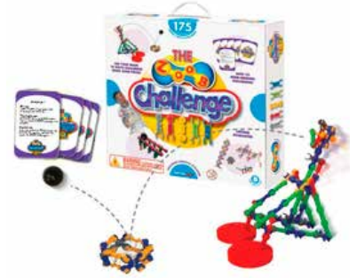
Zoob Jr. 55 pc. Set

request, $500=1 free case of Zoob 35 to offset freight, $750=FFA, $1000=FFA and 5% discount.