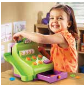
Sprouts, Ring it Up!