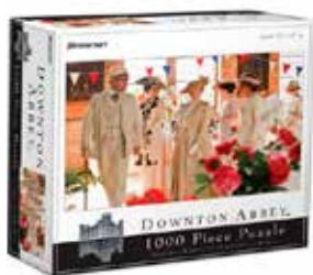
Downton Abbey, 1,000 pc. Puzzle asst.