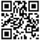
Best of Best