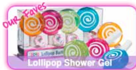
Lollipop Shower Gel

• October Lap Desk Deal: Selected styles of Three Cheers for Girls lap