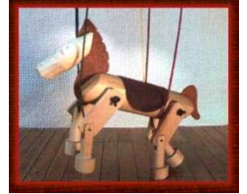
Wild Horses-Natural Finish