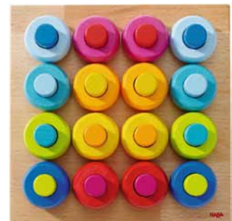
Rainbow Whirls Pegging Game #2202