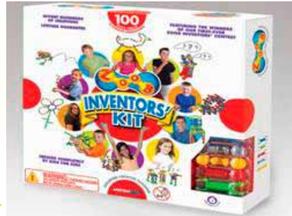
Inventors Kit # 11100