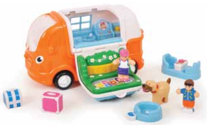
Casey Camper Van from WOW

• Promo: Purchase $250 worth of WOW product and receive the following promotional items FREE: 1 Free Standing WOW Banner (Handy Heroes themed), 36 Handy Heroes Sets, 1 WOW display sign, 2 WOW Wobblers signs. All to be used to promote the WOW Handy Heroes Free Gift with Purchase Promo. Reference item #48483309 when ordering. Quantities are limited