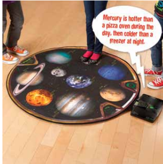
NOW SHIPPING #5279 Planetary Mat

code "Jolly" on all orders. Expires October 31st, 2012.