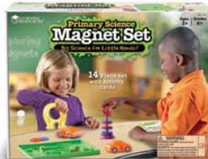
Magnet Set #3784

options list, $1500=choose two term options from term options list, $3000=choose three term options from term options list, $5000=receive all three term options on list and FFA on a future order (promo code HOLFUTURE and future ship order must ship by 11-30-12). Term Options List:~ Free Freight (promo code HOLFF2012), Net 120 days dating (promo code HOL120DAYS), or Additional 5% off entire order (promo code HOLEXTRA5). Orders must be for immediate shipment. Expires October 31st, 2012.