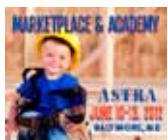
Best of Best