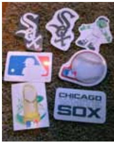
Shrinky Dinks MLB

No dollar minimum, No case packs, buy exactly what and how you need, one shipping location in the Midwest, one place to buy from over 90 vendors, and over 800 products to buy from.