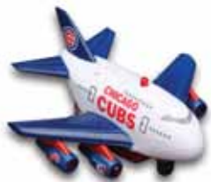
MLB Pullbacks with Lights and Sounds

May Special: $500=N30 & FFA, $1000=N60 & FFA, $1500=N90 & FFA. Order Chitter Chatters, Mad Mutts or Crazy Kats and pay only $9.00 each (regular price $10.00). They will be in stock May 7th. Please mark the special price on orders. (Chuckle Buddies are not part of the promotion). Ends May 31st, 2012.