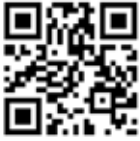
Best of Best