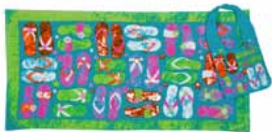
Towel Set Sandals

before they are sold out! Ends June 30th, 2012.