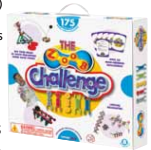
Zoob's Challenge Set

no solutions—it's up to kids to use Zoob pieces (and other materials they choose) to build contraptions that solve the challenges. The Zoob Challenge features 175 Zoob pieces, string, wheels, a ball, rubber bands, a foam play pad, and 25 challenges based on STEM