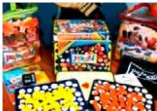
Can you Pajaggle?