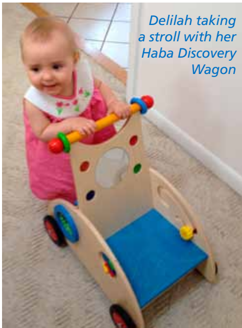
Delilah taking a stroll with her Haba Discovery Wagon

these five all English best selling games and receive a 5% discount. Must purchase this exact assortment in order to receive the 5% discount. Assortment includes: #5654 Monkey's Gold $6.00/4, #5655 Tree Top Trouble $7.00/4, #4789 Rhino Hero $6.00/4, #3284 Mummy's Treasure $6.00/4, and #3492 Where is Leo? $6.00/4. Ends June 30th, 2012.