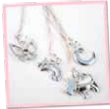
Beautiful necklaces from EMILY