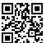
Best of Best