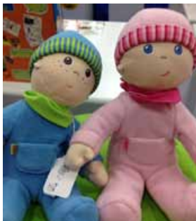
Haba's Snug Up Dolls, Luis & Luis

on pages 217-219 in the 2012 catalog and also includes the NEW Sun Bistro sand items that are not in the catalog (they were in the NEW Spring Items Flier).