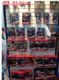
New from Toysmith Wild Planet

You don't want to miss this one... tons and tons of great new items you will want to stock up on immediately! Also pre-order your Halloween and Holiday items for later shipping. Copies should have arrived in your mailbox already. If not ask your favorite sales rep for a copy or for the link to view online.