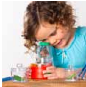
BugWatch from Educational Insights