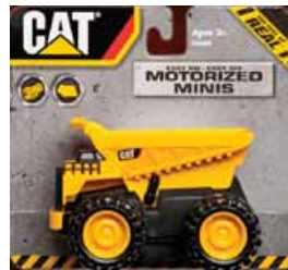
Cat Trucks NEW from Daron