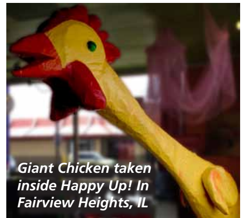
Giant Chicken taken inside Happy Up! In Fairview Heights, IL