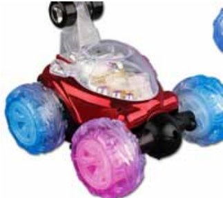
Remote control Stunt Vehicle, from Daron