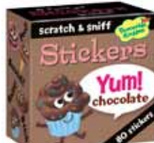
Scratch and sniff Chocolate stickers

Purchase any PK card program and receive the following benefits... greeting cards are now 100% returnable for exchange at time