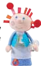
Little Miss Fidget doll puppet, from Haba