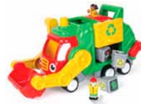
Flip 'N' Tip Fred, from WOW!