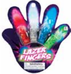
Lazer Fingers from Toysmith great stocking stuffer

Randomline is the maker of the very creative doodle pads and games. Makedo is a reusable connector system that enables materials such