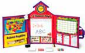
Pretend and Play School