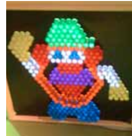
Mr. Potato Head at Chi Tag Dinner