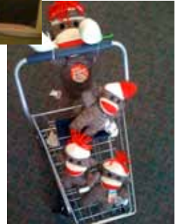
Sock monkeys playing with Toysmith Grocery cart at the Best Toys office

Remember... On all programs and specials credit must be approved. Also, on all FFA offers, if invoice is NOT PAID ON TIME, freight must be paid. Please consider these rules when placing orders!!